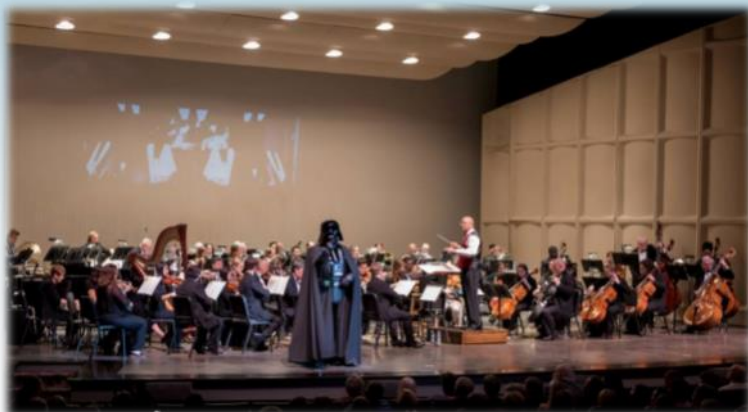
POPS I ~ October 2017 The Magical Mystical World of John Williams