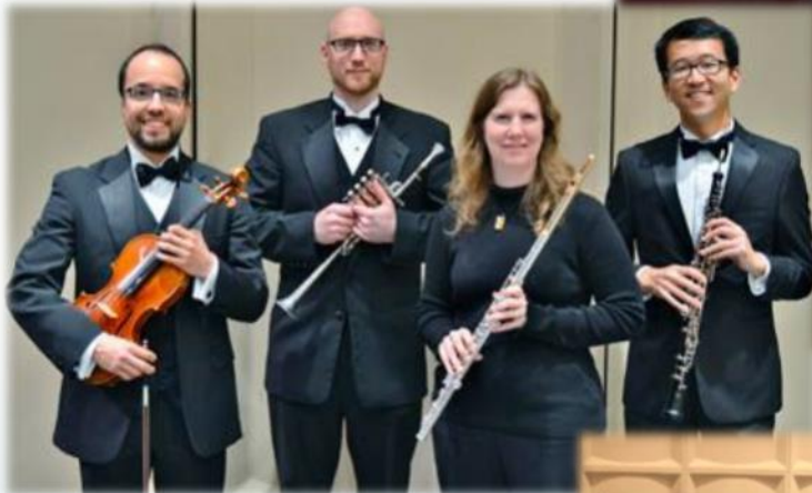
SOST concerto soloists

Classic II November 2017 A Marriage of Bach & Beethoven