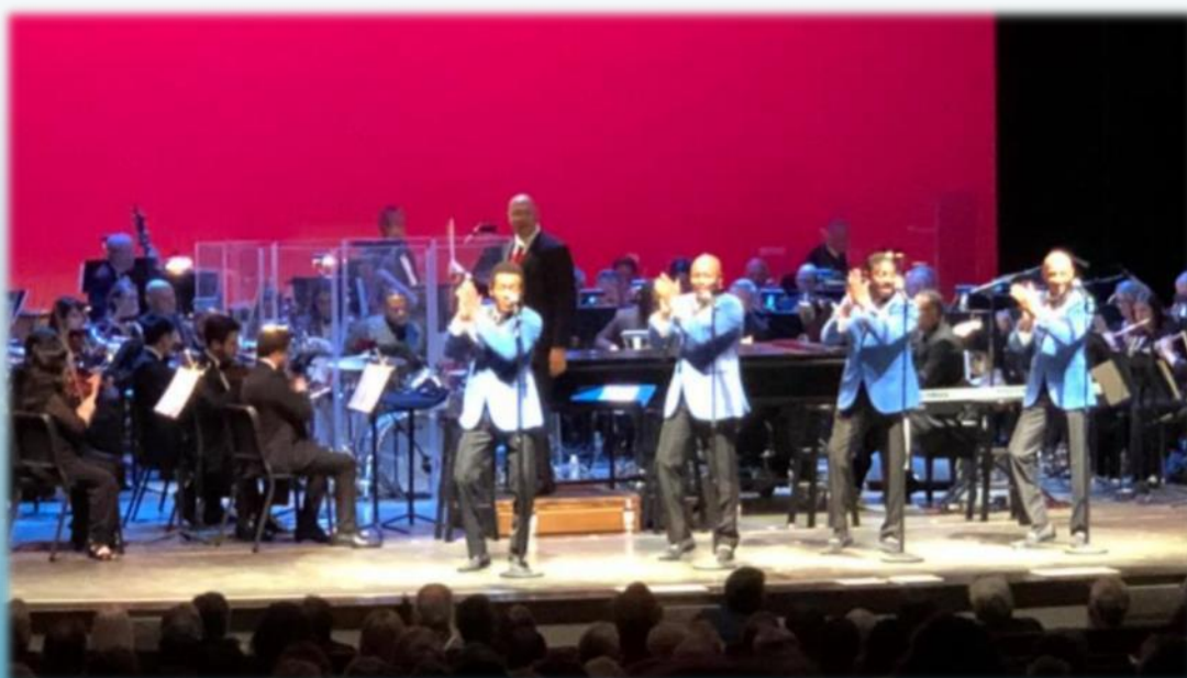
POPS II ~ March 2018 Spectrum, a Tribute to Motown and R&B Music